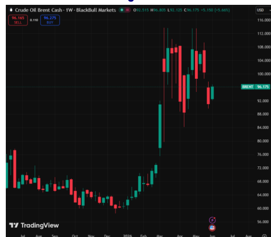
Exhibit 3: Brent Crude Surge as US-Iran war re-escalate